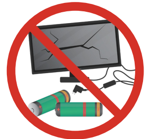
NO electronics or batteries