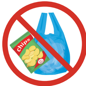
NO soft plastics bags or wrapping