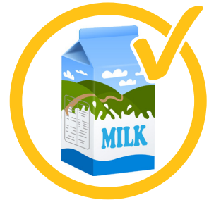
Juice & milk cartons