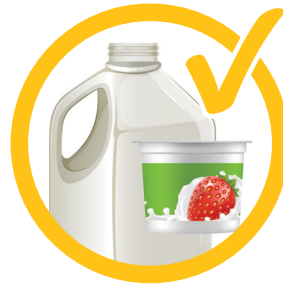
Hard plastic containers & bottles