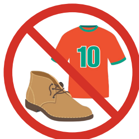
NO clothing, footwear or textiles