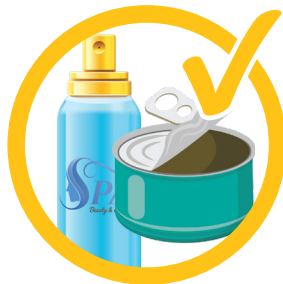
Tins, cans & aerosols