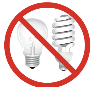
NO light globes