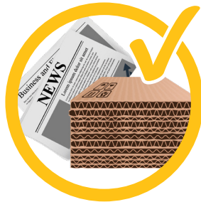
Paper & cardboard