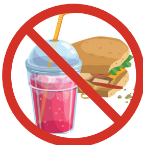
NO food or liquids