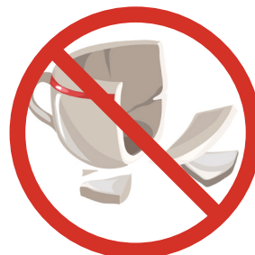
NO broken glassware or crockery