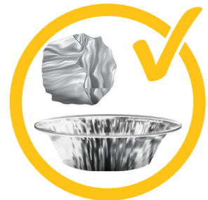
Clean aluminium foil